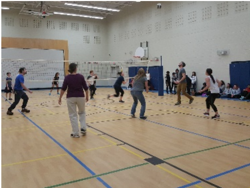
Staff vs Student Volleyball